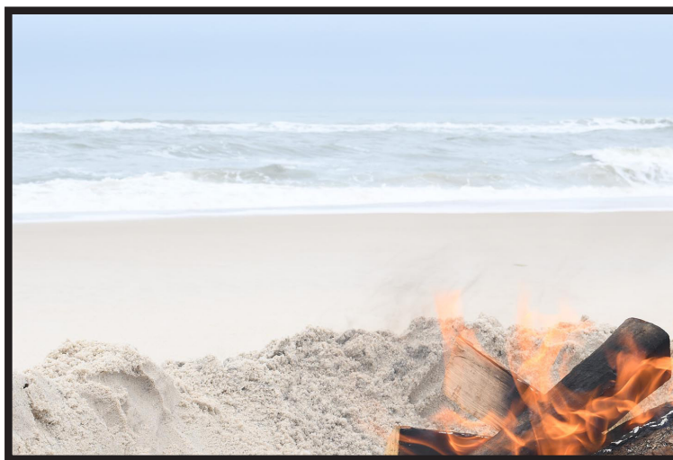
Chilly Morning on the Beach, Assateague Island

Do not wait for your magazine to arrive to register.