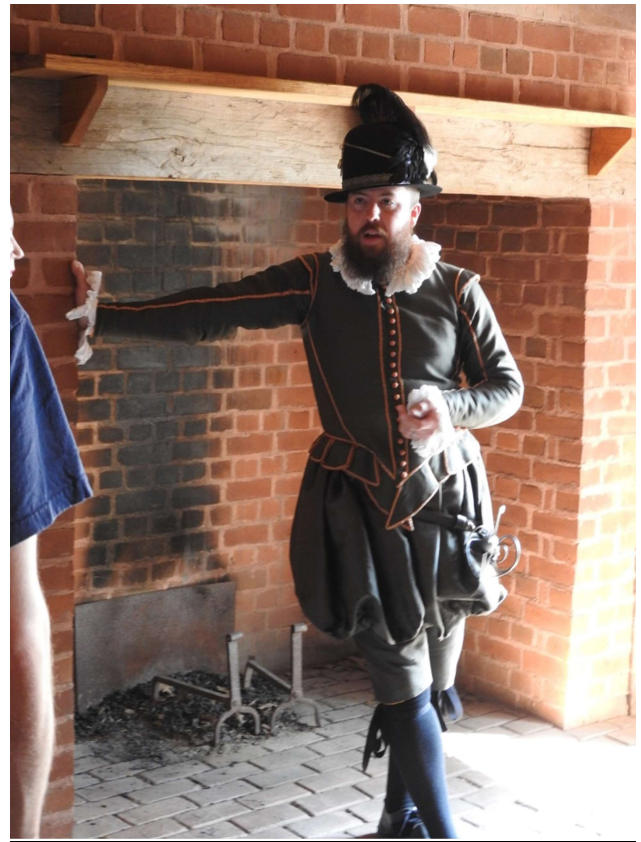
A councilor taking a break during proceedings.

Accompanied by my wife and one of my sisters, I enjoyed attending the Society's 400 th anniversary activities. However, I did so on a part-time basis. The three of us plus a cousin were torn between the Jamestowne Society and the National Society of Claiborne Family Descendants. The latter held its reunion at the same time and in the same area. I ended up with one foot squarely in each camp.