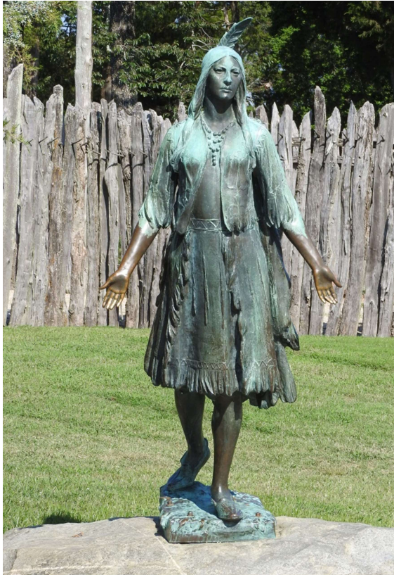
The 1922 statue of Pocahontas, or Mrs. John Rolfe